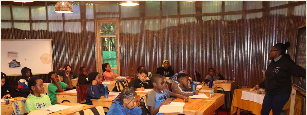
NWST Karen Campus, Grade Six Building, Nandi Road