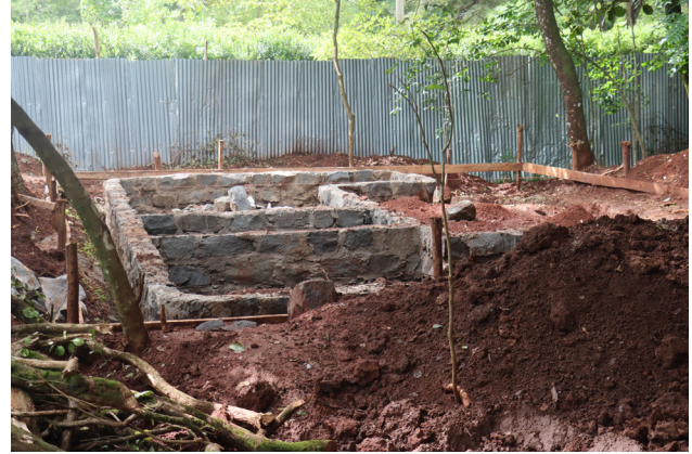
Ongoing construction at the NWST Karen Campus, Nandi Road

After negotiating and finalizing an appointment with the contractor, construction for Phase 1.1 of the campus commenced in April 2023. This initial phase will consist of four secondary classrooms, five pre-primary classrooms, eight primary classrooms, three toilet blocks (for each cluster), and two septic tanks. The location and positioning of the buildings on the site were carefully evaluated to minimize the need for tree removal. Priority was given to preserving older and indigenous trees to maintain the forest atmosphere, while the clusters were organized to foster a sense of community and belonging for each age group.