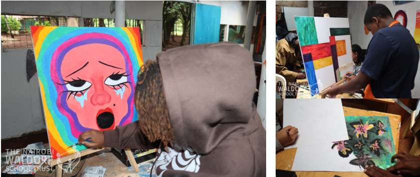
Display of Paintings created by NWST Upper Primary and High School Students

As per Rudolf Steiner’s teachings, Waldorf School Education goes beyond being a mere pedagogical system but is an art form aiming to awaken the inherent creativity within individuals. The Waldorf Gallery embodies this philosophy by guiding students through the process of expressing their inspirations, ideas, and emotions on canvas.