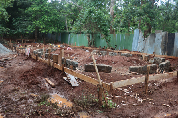
Ongoing construction at the NWST Karen Campus, Nandi Road