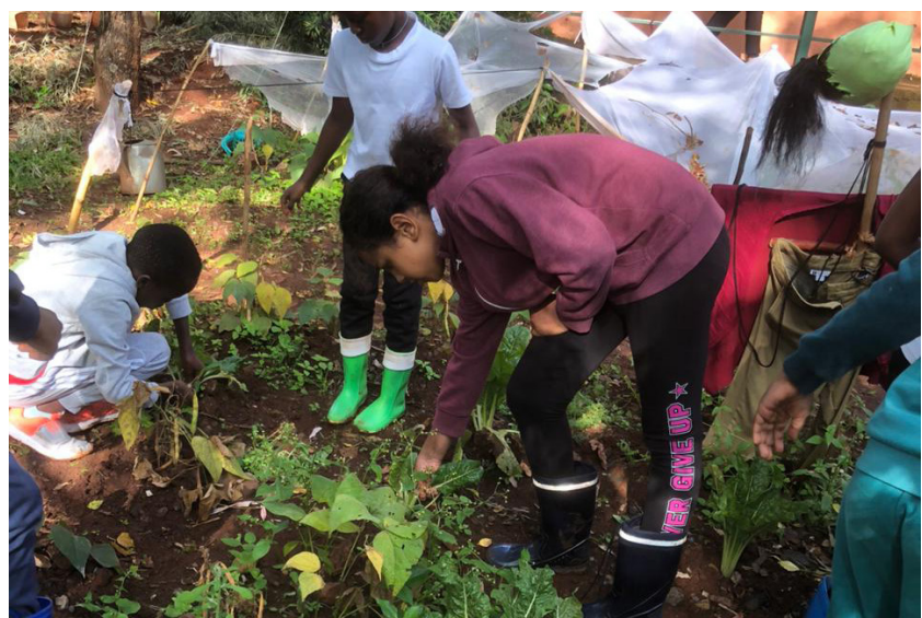
NWST Students During the Gardening Block